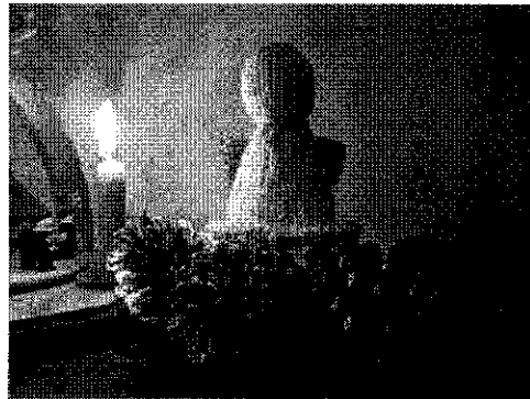
This angel is knitted in sparkly cream, with sparkly mohair wings.

You will need a basic knowledge of knit and purl to make these angels but don't let that stop you if you haven't done it before. Find someone who can teach you and ask them to help you learn a new skill.